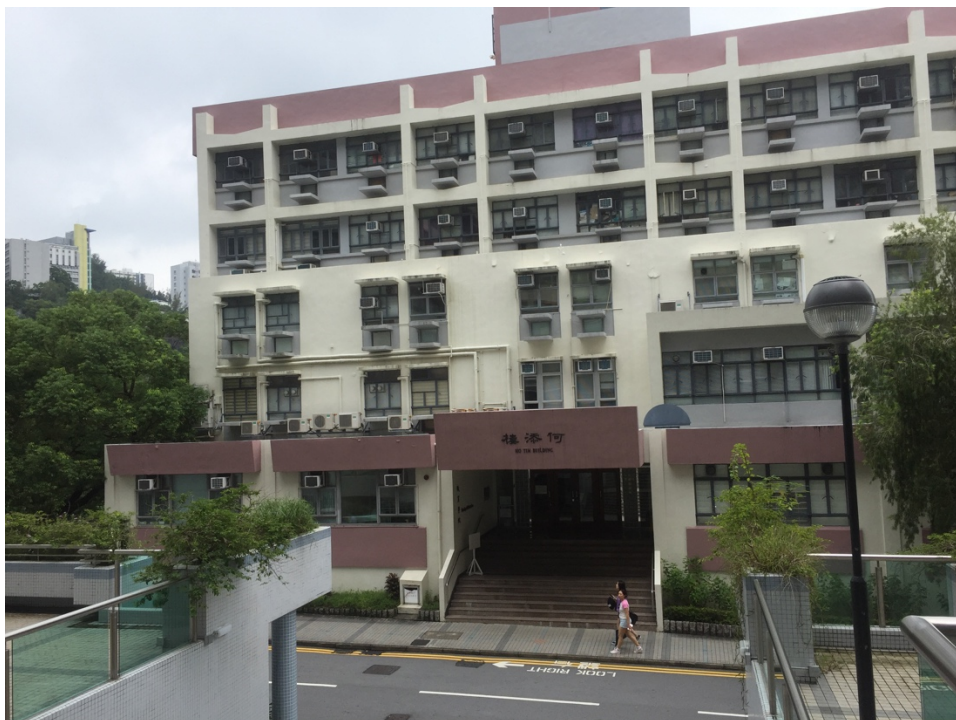
The Faculty of Education of the Chinese University of Hong Kong (Ho Tim Building).

as the teacher's professional science. At Stockholm university, I work at the Department of Mathematics and Science Education in courses for pre-service and in-service Science teachers in Primary, Secondary and Upper Secondary School. Some of those were the targets groups in the courses I was involved at the Department of Instruction and Curriculum Studies at CUHK. It is interesting to point out that the teaching in my courses was organized in late Fridays or Saturday mornings due to that a significant proportion of the at the Faculty of Education are in-service and these are the times that provide the best opportunities to attend the courses.