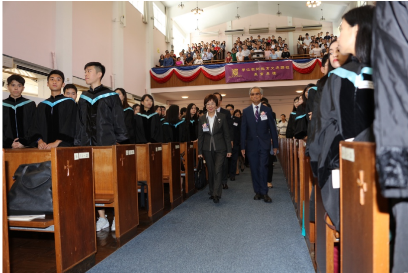
2018 Postgraduate of Education Diploma programmes' graduation ceremony.

For me it was an opportunity to understand the value of certain academic traditions for elevating the teacher profession in Hong Kong and probably in other Asian countries. We do not have such academic traditions at Stockholm University, at least regarding Teacher Education and I believe that in this aspect we have some lessons to learn from CUHK. Besides the Graduation, I witnessed that CUHK student life offers plenty of activities and events. CUHK is the only university in Hong Kong that have a collegiate system, where the undergraduate in the first years live in the campus.