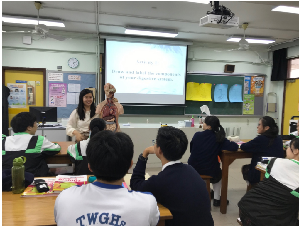
One of the student teachers of the PGDE course teaching Biology during her Practicum.

I had the opportunity to observe lessons, talk with the students and pupils of the school and even participate and provide feed-back in the discussion with the student and supervisor after the lessons. In some aspects, the Practicum at Teacher Education in CUHK and Stockholm University are similar, but in Hong Kong the Practicum it is not a course by itself but organized in a more informal form by the Department. In this way, routines, contact with the schools and assessment and students' following-up seems to be rather pragmatic and remains a bit how it was in teaching Education at Stockholm when the Practicum was not structured in independent courses. Apparently, the role of the supervising teacher in the school is not so well-defined as in teacher education in Sweden, where they have to take courses and be certified as supervisor, however teacher education at CUHK has developed during years a network of schools and teachers that ensure a Practicum of good quality for the student teachers. I learn too that the Practicum period in Hong Kong is significantly shorter (two months in two equal periods during the last years of the programme) and presume that the student teacher can teach independently after the second