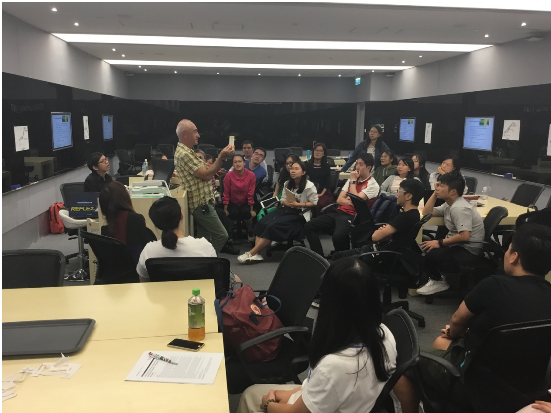
One of my lectures in the Master of Education. The classroom was well equipped to work in small groups. Every group had an own screen and modern glass blackboards.