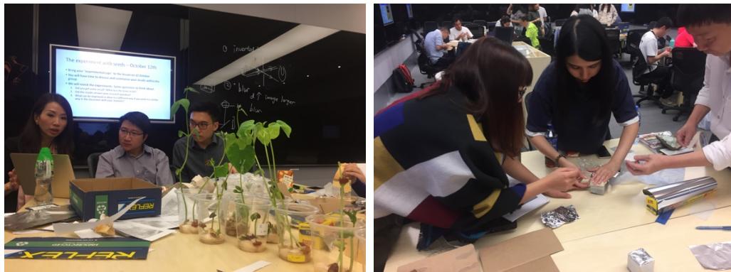
Inquiry-oriented activities during the Master of Education course.

in the Master of Education course) was rather theoretical, more lecture addressed with some elements of discussion.